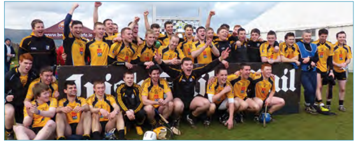
The victorious NUI Maynooth Hurlers with the Ryan Cup.

A five year wait came to an end for the NUI Maynooth hurlers when they retained the coveted Division 2 Ryan Cup Championship over the first weekend in March.