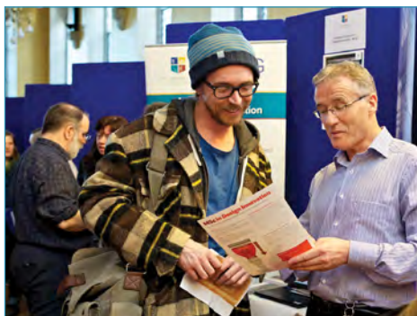
The Postgraduate Open Evening in Pugin Hall.

The Annual Postgraduate Open Evening took place on Tuesday 11 March in Pugin Hall. With break-out talks in Renehan Hall covering a wide variety of subjects including funding options currently available, the large numbers who attended had plenty of opportunity to seek advice on further study at the University from departmental representatives.