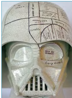
The Vader Project.