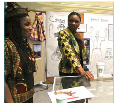
The Launch of the Celebration of Liberian Women Exhibition.

Coinciding with celebrations for International Women's Day 2014 on Saturday, 8 March, the Department of Applied Social Studies and the Liberia Solidarity Group (LSG)