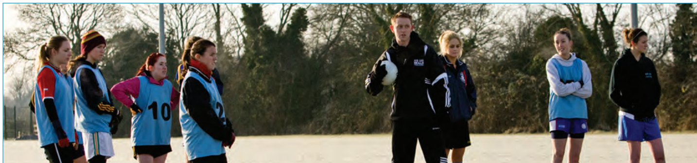
Colm “The Gooch” Cooper, Kerry All-star GAA footballer taking the NUI Maynooth Ladies Footballers for a training session on Tuesday, 11 December on the North Campus GAA field. As well as advising on attitude and diet, he passed on some technique tips, did some shooting practice and even joined in on a match. This was organised through the Ladies Football Club and the AIB Bank on campus.