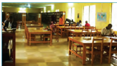
Students using the Library, University of Makeni.

The Library recently organised a shipment of books to the University of Makeni in Sierra Leone.