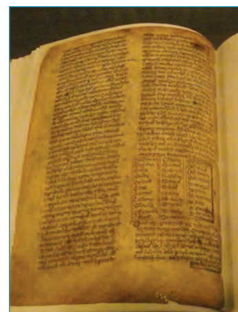
Pages from Lebor na hUidre.