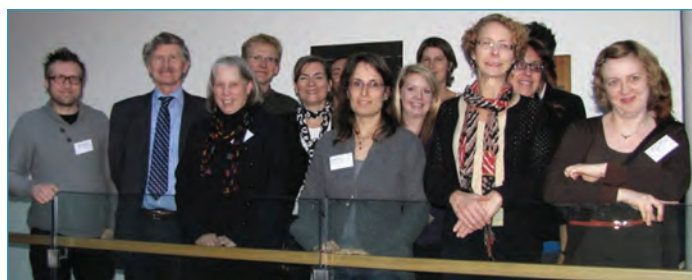
Pictured are participants at the DASISH Qualitative Data Workshop at NUI Maynooth on 21st November. The IQDA and the Digital Repository of Ireland co-hosted the workshop as part of the FP7 Infrastructures Project, DASISH (dasish.eu) with the purpose of examining the contribution that qualitative social science researchers and archivists can make to DASISH and to encourage their cooperation and involvement. Representatives from 10 European countries were in attendance.