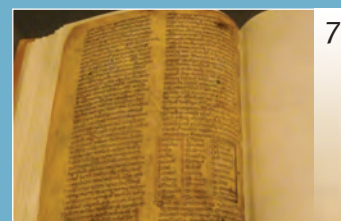
Law Department's Model Parliament