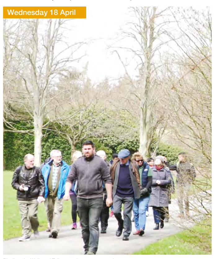
Biodiversity Walk and Talk around campus grounds

Group members include local and organisations interested in promoting biodiversity, including Intel Ireland (Leixlip Campus), Maynooth University, Carton House and Maynooth, Leixlip and Celbridge Tidy Towns. The event was followed by a guided walk and talk, which visited some biodiversity hotspots across the campus.