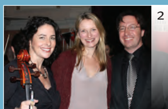
RTÉ's Big Music Week