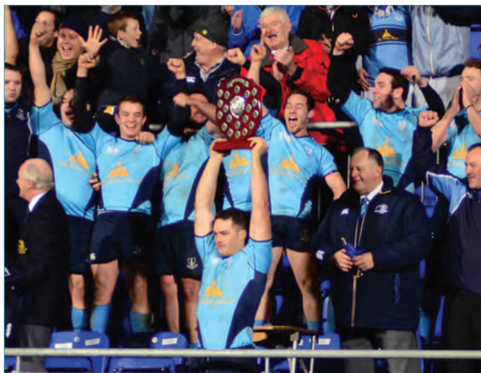
NUIM Barnhall lift the Leinster Shield for the first time.

The first Historic Colours Game took place on the rugby pitch on the North Campus on Saturday, 30 November with a victory for NUIM Barnhall against Univesity College Cork, 17-14.