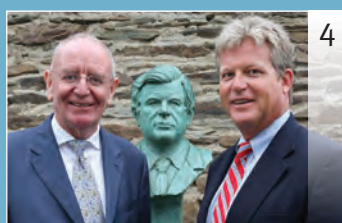
Inaugural Edward M Kennedy Lecture