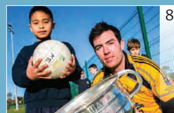
SU's Community Engagement Week