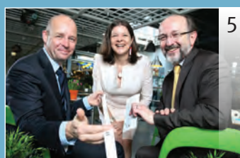
3U Partnership with IKEA