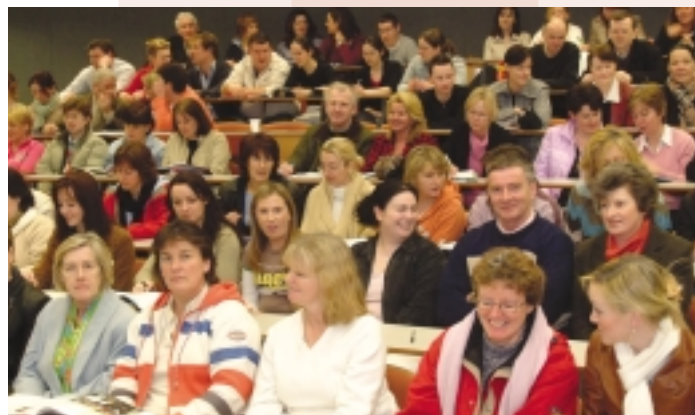
Some of the outreach students who attended on campus.