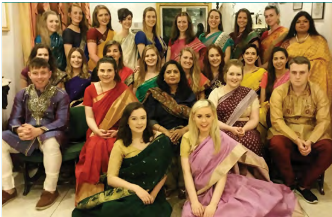
Final Year Maynooth University Froebel Students on placement in Kolkata

More than 230 Froebel NQTs have taught with Indian teachers in HOPE-supported Education centres and Bengali State Schools in Kolkata for five-week periods. Froebel NQTs reinforce and model child-centred methodologies, which