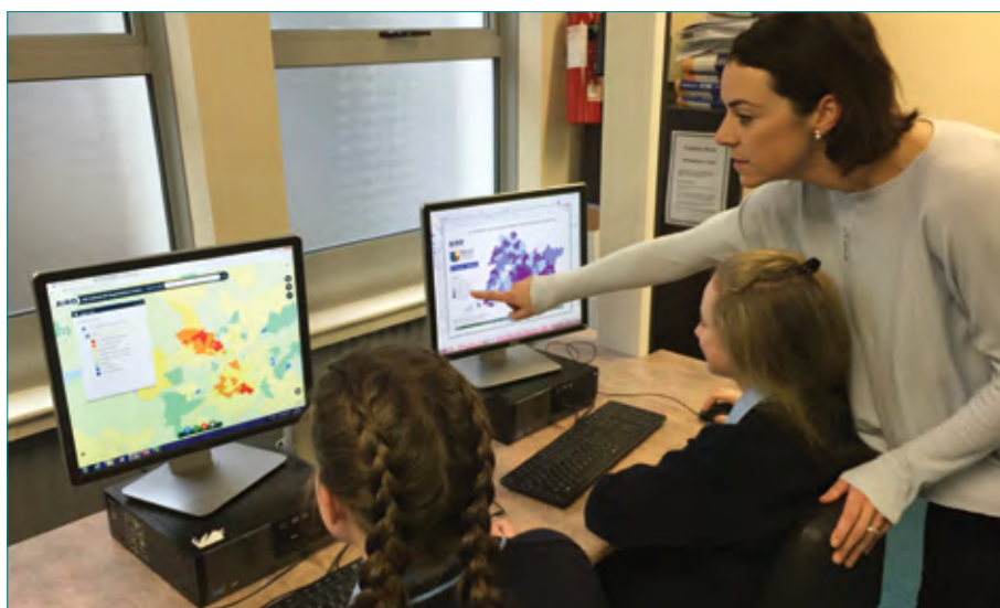
The Geography teacher working with students in Colaiste Muire in Ennis

AIRO will be demonstrating this module at the TY Expo 2017 in September and plan to make the module available to all post-primary schools from October. Participating schools will initially take part in a one-day workshop for TY and Geography teachers at the AIRO headquarters and then deliver the module for the following eight-week period from their own school.