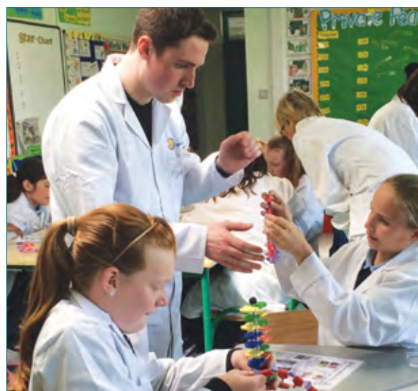
Primary School Children building DNA in their classroom

Teachers who like would like their school to participate in the programme, can email cellexplorersnuim@gmail.com for further details. To find out more about Cell EXPLORERS activities and the 'Fantastic DNA' school roadshow, visit www.cellexplorers.com or follow Cell EXPLORERS on Facebook or Twitter.