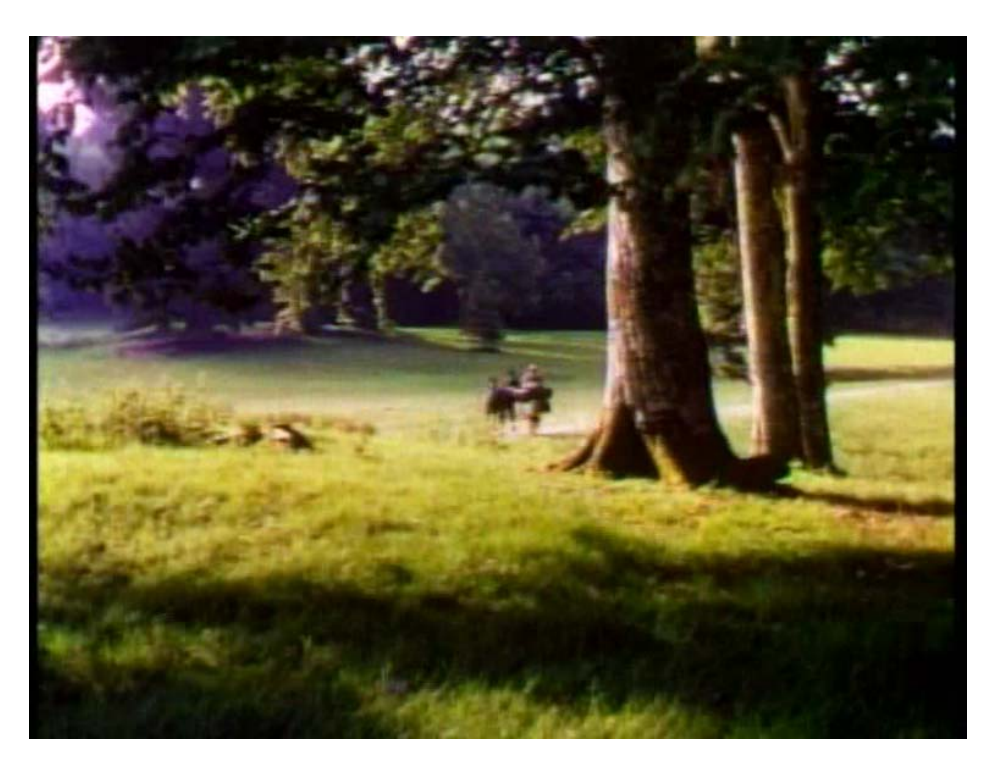
Fig. 1. The Quiet Man (Republic Pictures, 1952)

driving Sean along through the countryside in a jaunting cart as is depicted in the following still (Fig. 1):