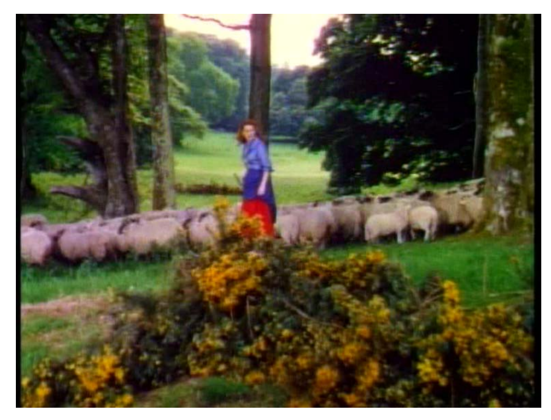
Fig. 2. The Quiet Man (Republic Pictures, 1952)

Gibbons has subtitled this particular shot as 'paradise regained' and states the following: