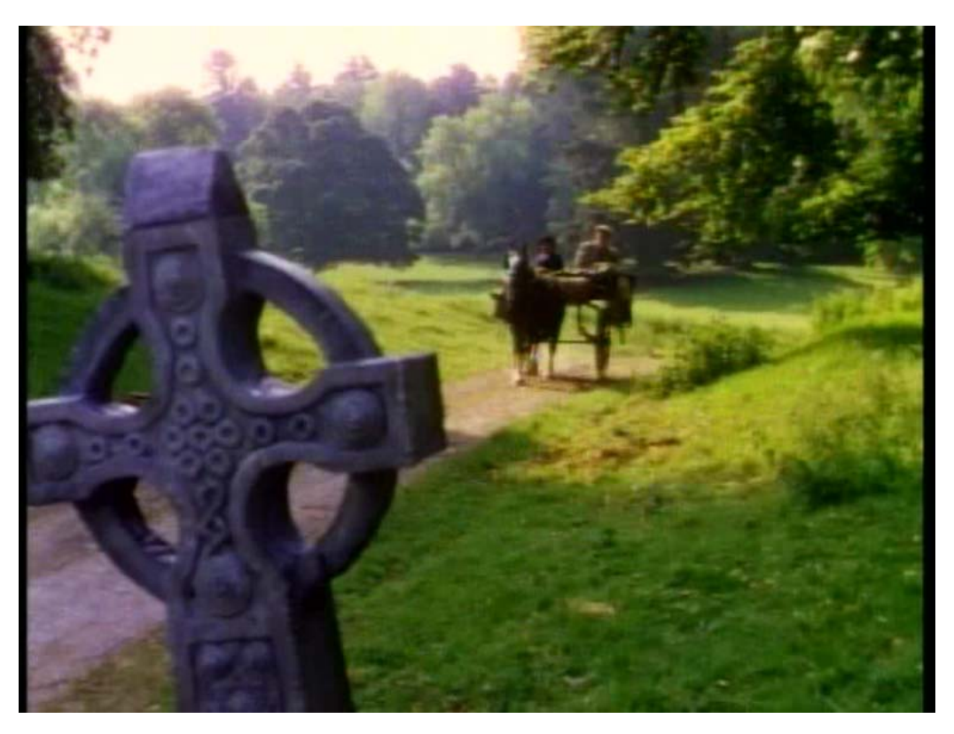
Fig. 2. The Quiet Man (Republic Pictures, 1952)

The following scene has another example of visual extravaganza. As Michaeleen and Sean pass along the now visible road, an old Celtic cross comes into view (Fig. 2):