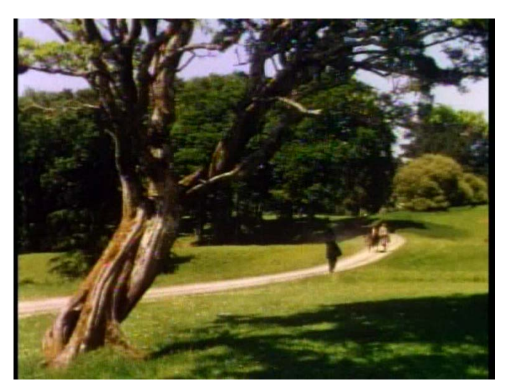
Fig. 3. The Quiet Man (Republic Pictures, 1952)

Sean and Michaeleen continue their sojourn through this exotic landscape until they meet the local priest. The next still depicts the jaunting car approaching the priest. Here, we are provided with the most panoramic view of the landscape in this sequence (Fig. 3):