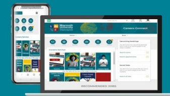
CAREERS CONNECT PORTAL