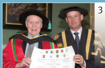
Chuck Feeney Honoured