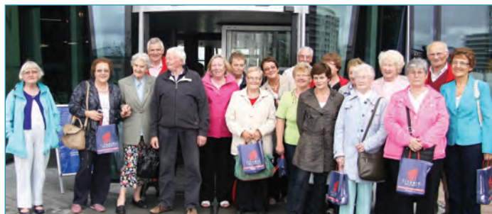
Retired Staff members and friends visited the Titanic Exhibition in Belfast.

A group of 30 Retired Staff members and friends paid a visit to the Titanic Exhibition in Belfast in July.