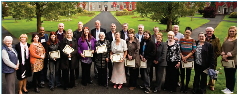
Participants with their certificates pictured after the award ceremony on campus.