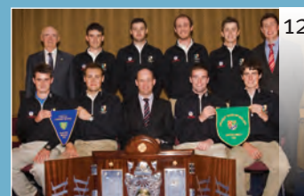
Golf Team Win Barton Shield