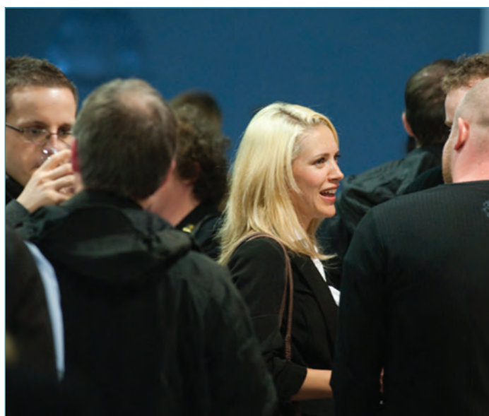
Alumni and Staff mingling at the event.

Phoenix Mezzanine on Friday, 21 September was the venue for alumni celebrations of 25 years of Computer Science at Maynooth.