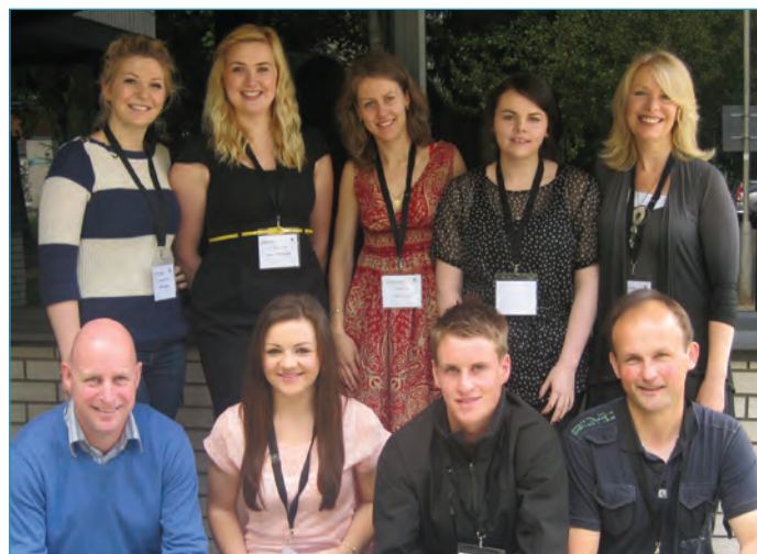
The NUI Maynooth researchers involved in the Kildare Fáilte Research Project.