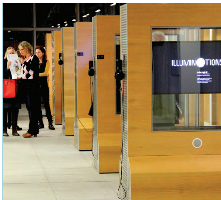
The new digital-visual exhibition space in the Foyer of Iontas.