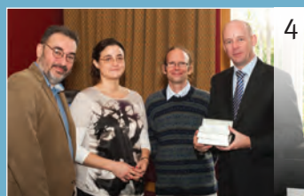
Teaching Fellowships Launched