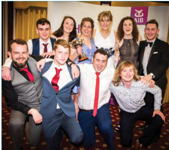
Winner of the Clubs League (a league that is points based on a range of activities such as events, training, activities, attending council meetings, account-keeping) - MUCK

The event recognises the hard work of the students involved with the societies and clubs on campus throughout the year. A joint initiative between the University and Maynooth Students' Union, the Clubs & Societies Awards are run by students for students. MSU Life, home to the 100 plus clubs and societies on campus, celebrated its first anniversary at the event.