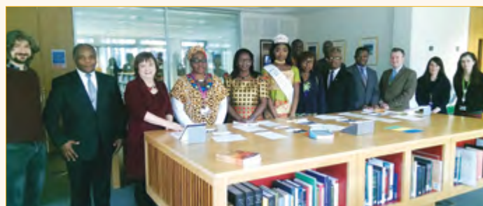
Visit to Special Collections Reading Room

This was followed by a celebration of African culture in the library foyer with music, dance, poetry and samples of African food.