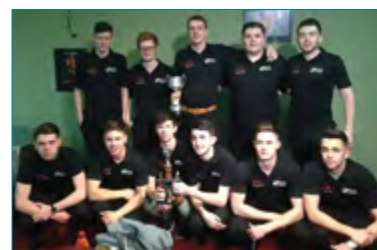
The Maynooth teams pictured at the All-Ireland Snooker Intervarsities

The club added to their success in February at the Irish Pool Intervarsities when they won the Shield competition. The club has recently invested in new supreme pool tables, and hopes to build on this success in pool and cement its reputation as the best cue-sports institution on the island of Ireland.