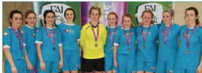
Pictured is Maynooth University Ladies Senior Squad who won the CUFL Premier Division on 9 March at Athlone IT defeating Sligo IT 4-1. This is the 2nd time they have won the premier division in three years.

In early March the Maynooth University Men's Fresher Squad defeated UL 3-0 in the final of the Colleges & Universities Football League Division 3 held in Abbotstown.