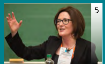
Junior Cert Business Awards