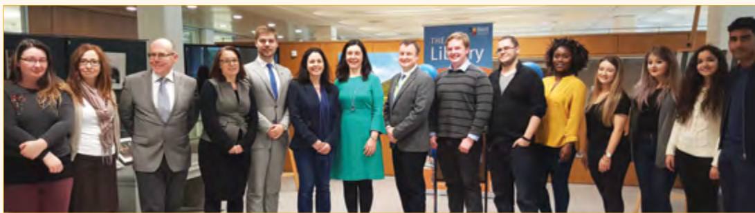
Participants in the Library Innovation Award