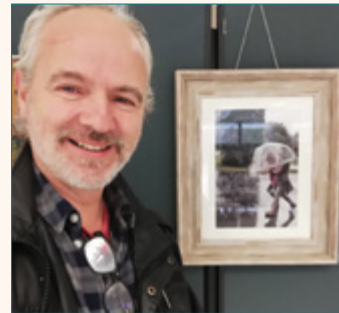
Commendation: Walking in the rain by Alan Monahan (Photograph)