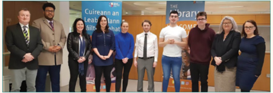
Finalists with the Dragons