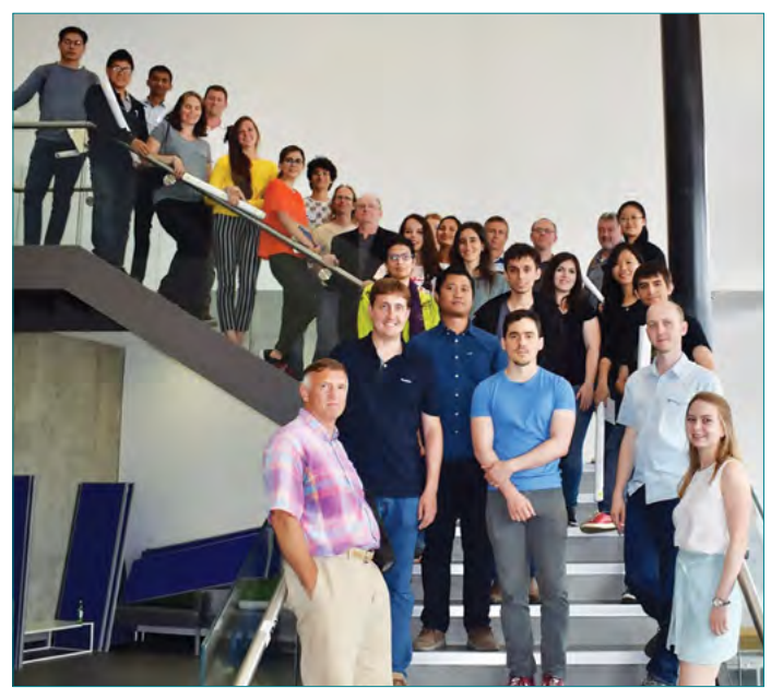
Participants at the Erasmus Mundus DESEM Summer School on campus