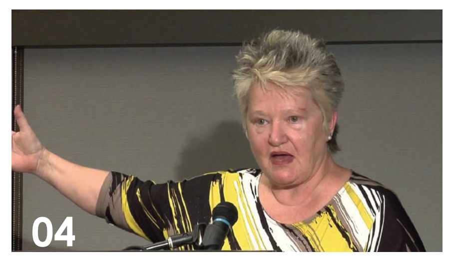
5th International Irish Narrative Inquiry Conference