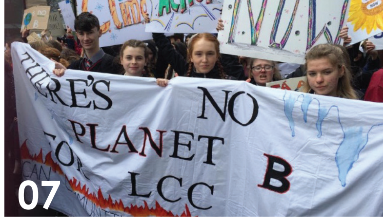
Climate action in Lucan