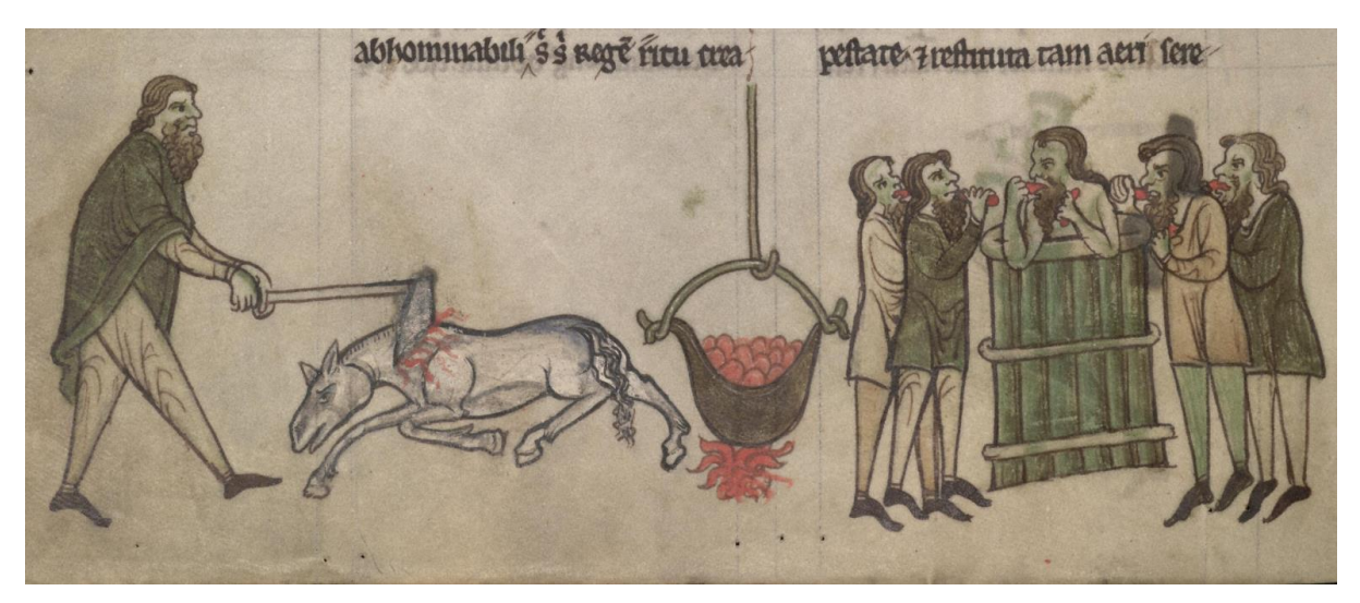
Illustration from MS 700 National Library of Ireland, f. [39] v.