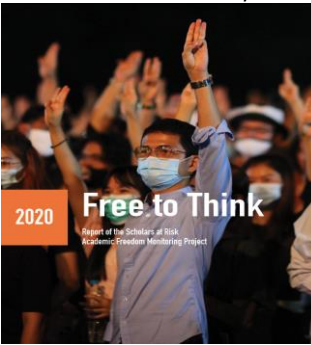
<u>Free to Think 2020</u> reports attacks on higher education between September 1, 2019 and August 31, 2020.

SAR network launched its annual monitoring report during a virtual conference on November 19, 2020, The Conference, also, marked SAR's 20th anniversary and featured the presentation of SAR's 2020 Courage to Think Award to Dr. Rahile Dawut, a scholar of Uyghur studies who disappeared in China in 2017 and is suspected to be held in state custody.