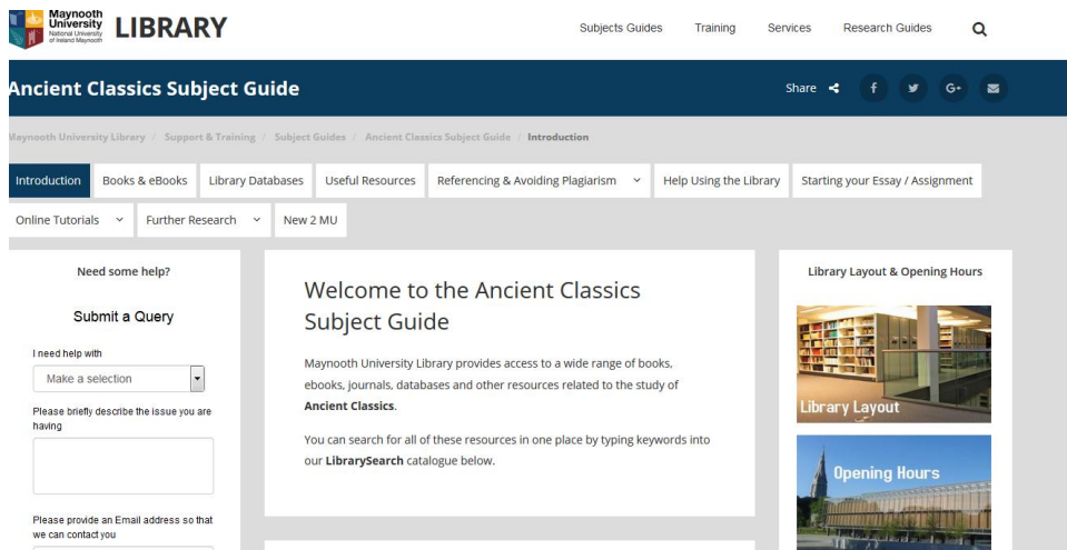
Fig 2. Ancient Classics subject guide online