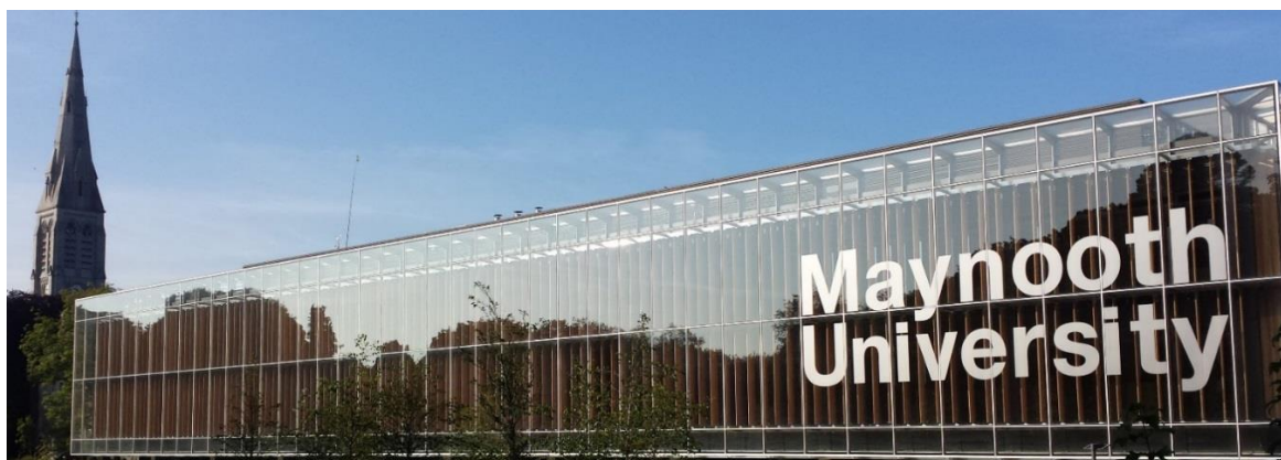
Fig 1. Exterior of MU Library

MU Library is a popular place to meet, study and research in. We're located in the middle of the campus on the southern side, beside the Kilcock road. Choose from a variety of study spaces; from the open-access area on the ground floor, where food, drink and chat is allowed, with access to over 50 laptops and print facilities, to the quieter areas on levels 1 and 2, with training rooms and meeting rooms. There's a Starbucks located on the ground floor, and even sleep-pods on level 1 if you need to re-charge. Use our bookable group study rooms ( nuim.libcal.com/booking/MU_GroupStudyRooms ) for your group project-work. MU Library hosts campus exhibitions and events in the foyer during the year, so there's nearly always something new to view.