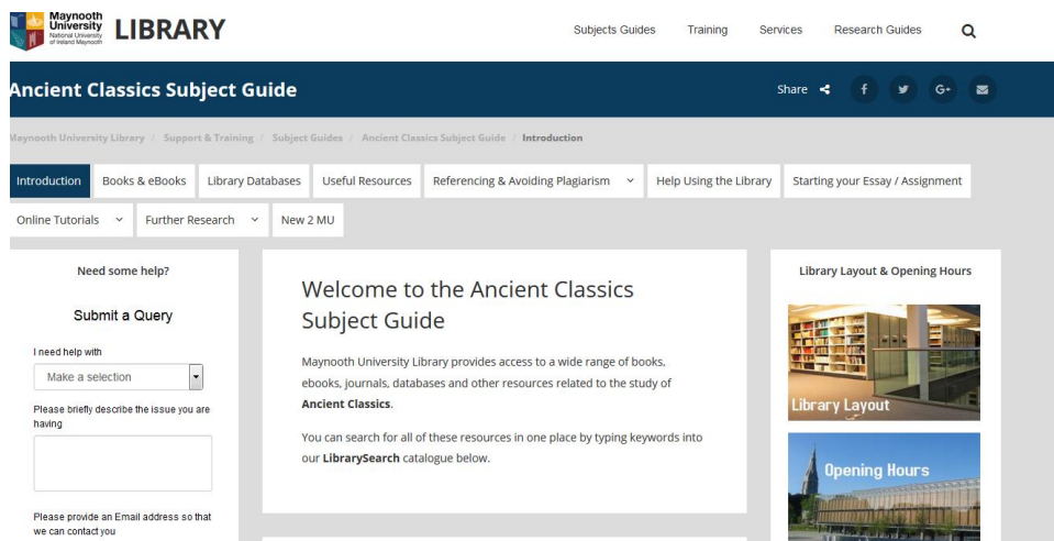
Fig 2. Ancient Classics subject guide online