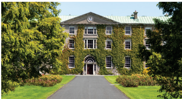
The Department of History, Maynooth University

Maynooth University's Department of History has European history – dating back to the early modern