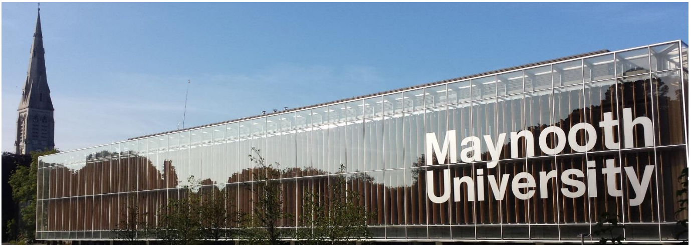
Fig 1. Exterior of MU Library

MU Library is a popular place to meet, study and research in with a variety of study spaces, meeting rooms and a Starbucks located on the ground floor. It provides bookable group study rooms for students (perfect for project-work) as well as a dedicated postgraduate room, on Level 2. It's also a portal to a vast collection of Anthropology resources in print and online through its searchable catalogue called LibrarySearch. The library homepage ( https://www.maynoothuniversity.ie/library# ) has a comprehensive range of information, training, supports and services that you can explore but for students of the Edward M Kennedy Institute, there's also a dedicated Subject Guide ( http://nuim.libguides.com/kennedy ) on our webpage that we recommend you use and bookmark, because we highlight new subject-specific material and news regularly in this space (see Fig. 2 below) for undergraduates, postgraduates and academics.