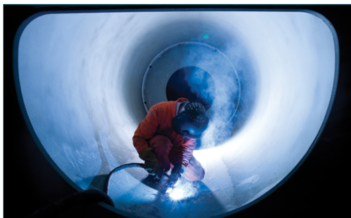
Fabrication of Oyster 1 wave energy converter

The project, INNOWAVE, will explore ways to optimise the energy capture and economic performance of wave energy devices. Three newly recruited early-stage researchers will divide their time over the three-year project between Maynooth's Centre for Ocean Energy Research and the Aquamarine Power premises in Edinburgh and Belfast, with site visits to the European Marine Energy Centre in Orkney, where Aquamarine Power has been testing its Oyster device for the past four years.