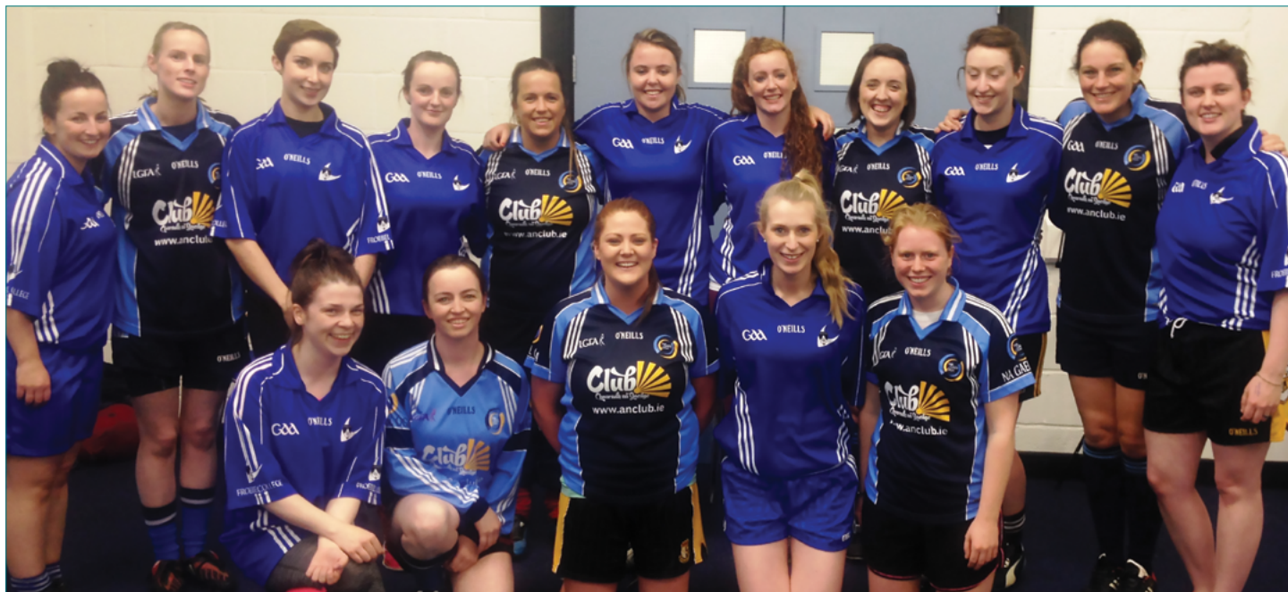
Mic léinn Froebel agus Na Gaeil Óga in Ollscoil Mhá Nuad