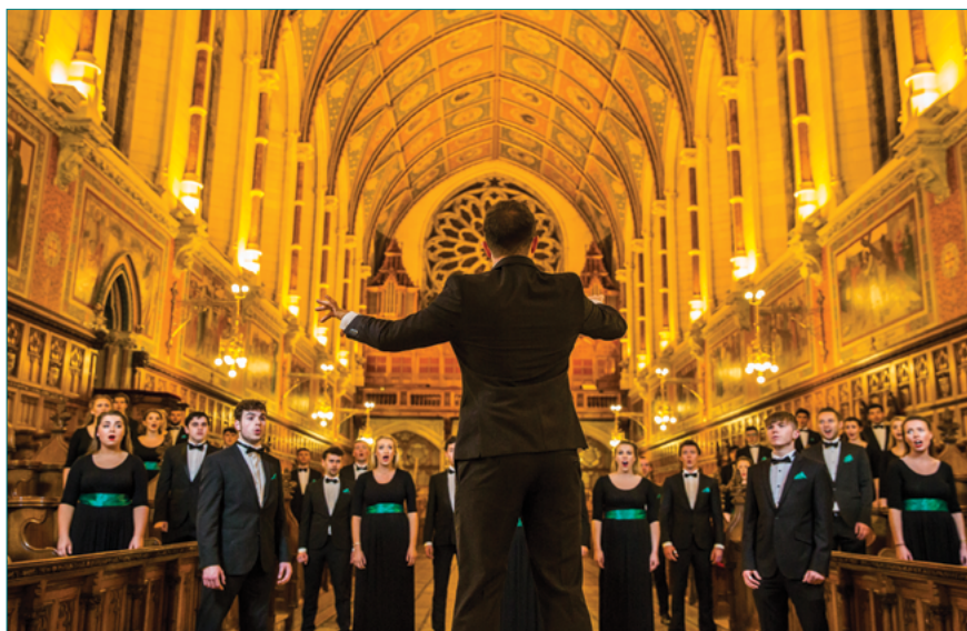
The Maynooth Chamber Choir