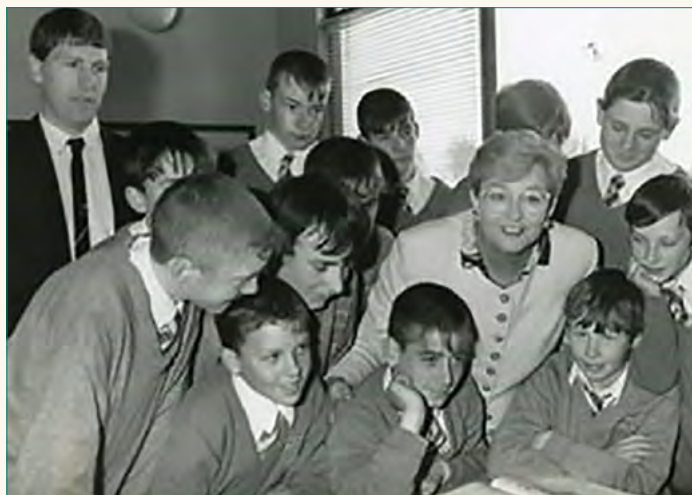
Niamh Bhreathnach visits a local school

A fascinating insight into the public and private life of former Labour Minister for Education, Niamh Bhreathnach, has been captured through a digital archive project carried out by the Library in June 2019. A collection of 59 photographs from Bhreathnach's personal collection was scanned by the Library. This collection addresses a range of different subjects, including Bhreathnach's childhood years in Blackrock, social life as a young woman, marriage and family life, introduction to politics, and the journey to becoming Labour's first Minister for Education. For further information please contact: library.specialcollections@mu.ie