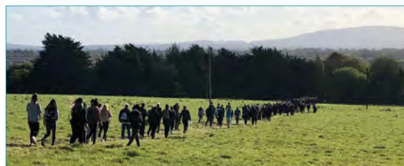
Pictured are the 200 participants on the annual Hamilton Walk