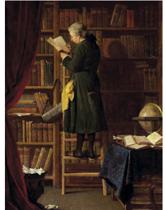
In the library, by Georg Reimer National Museum in Warsaw/ Wikimedia Commons

How did members of a household entertain or better themselves, what was popular to read with whom – men, women and children? The classics, natural history, literature, genealogy, fiction, and other subjects feature in many country house libraries, and very often a battered, plain copy of a publication will reveal more than the most pristine edition in a lavish ornamental binding. In what ways did books furnish minds as well as interiors?