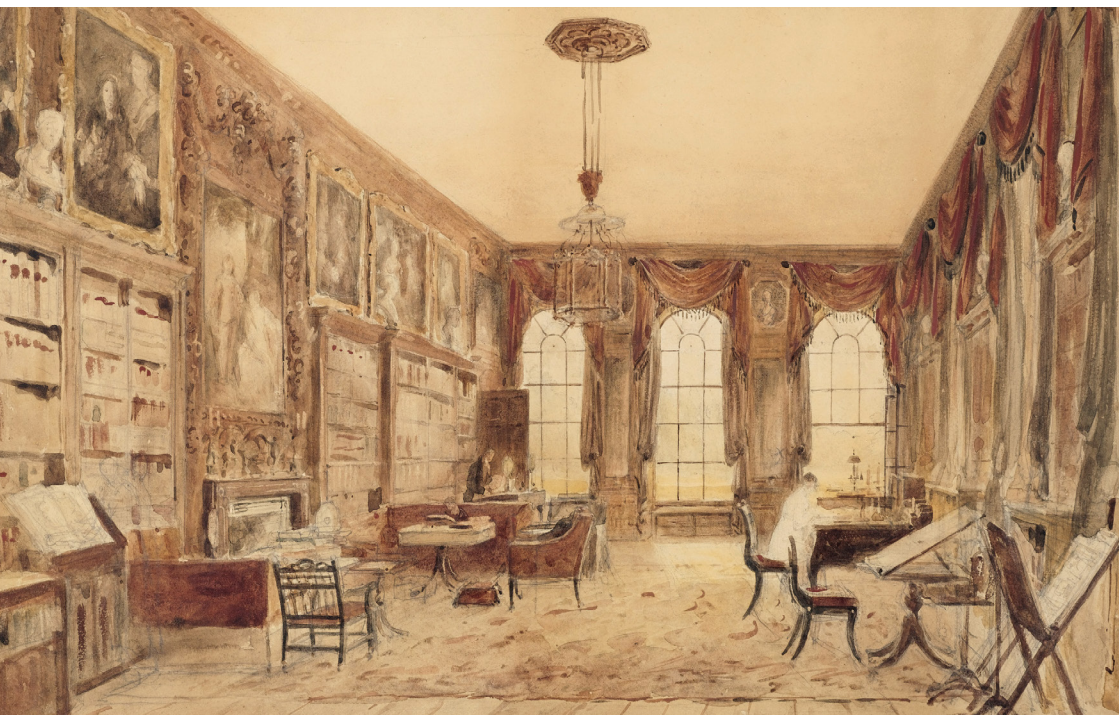
The interior of the library at Cassiobury, before 1816, by Augustus Charles Pugin