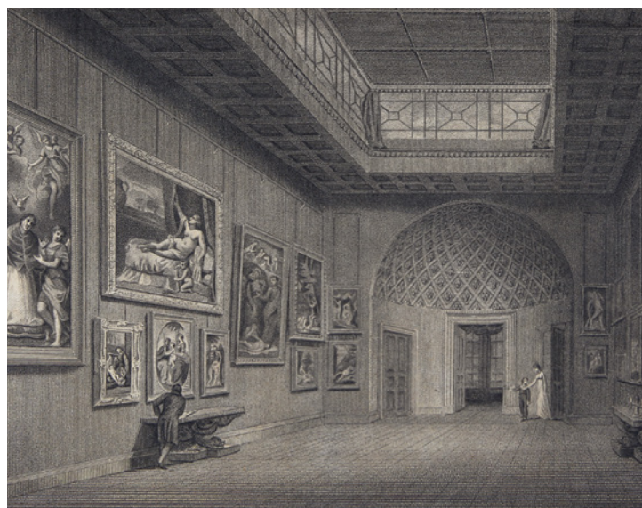
The Gallery, Cleveland House, 1808