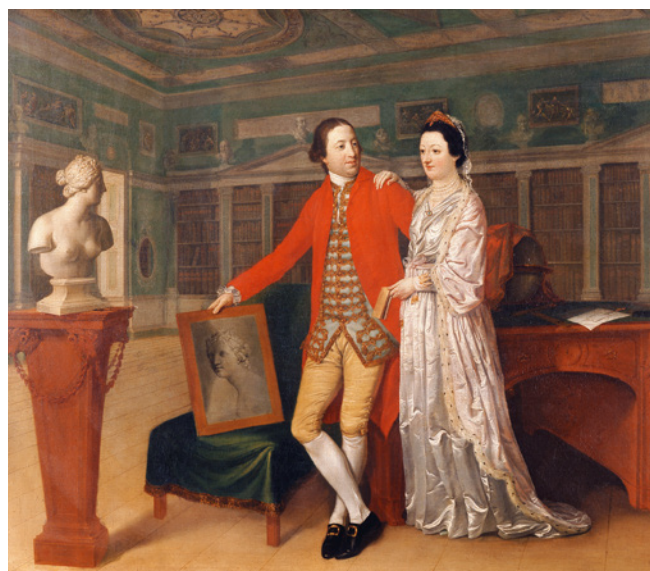
Hugh Douglas Hamilton Sir Rowland Winn and his Wife in the Library at Nostell Priory, c.1767-6