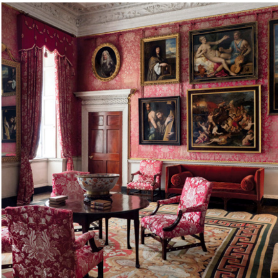
The Crimson Drawing Room, Castletown House