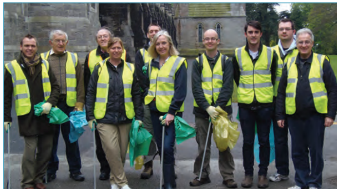
Students and Staff on the South Campus

On Wednesday, 2 May, 40 staff and students from NUI Maynooth joined forces in a litter pick in the town of Maynooth and on the University campus filling a trailer with a substantial quantity of separated waste. The initiative came from the campus environment working group recently established by the Faculty of Social Science. It had been planned for Wednesday 25 April as part of An Taisce's National Spring Clean in April, but was postponed for a week due to the heavy rain. The working group seeks to promote environmental awareness, the enhancement of the university campus as a landscape for learning and, in the longer term, more sustainable use of energy and resources. Over the coming period the group hopes to continue to promote these aims in keeping with the strategic plan of the University to develop NUI Maynooth as a "green campus".