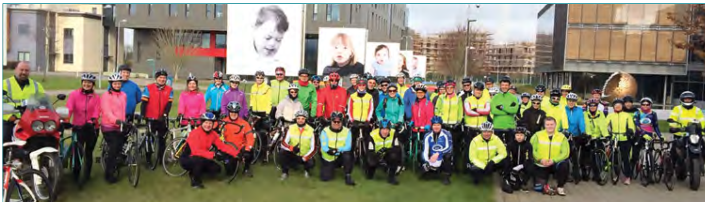
Some of the crew involved with the Galway Cycle 2016 pose with the exhibition in the background. This year's Galway Cycle took place over the weekend of 8-10 April, in aid of Down Syndrome Ireland.

Maynooth University is the first third-level institution to host a photographic exhibition entitled Here I Am , which features photographs of children with Down Syndrome. The exhibition, which ran from 7-11 March on the North Campus, displayed the images by photographer Dan Murphy