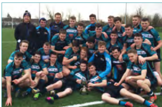
Fresher 2 team which defeated DCU in the C Championship final!

The camogie team reached the final of the Purcell Cup and the hurlers reached a Kehoe Cup final.