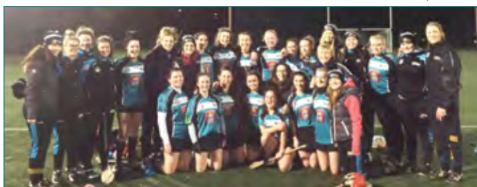
Leinster Intermediate Camogie Champions