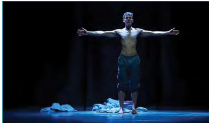
The Casement Project choreography