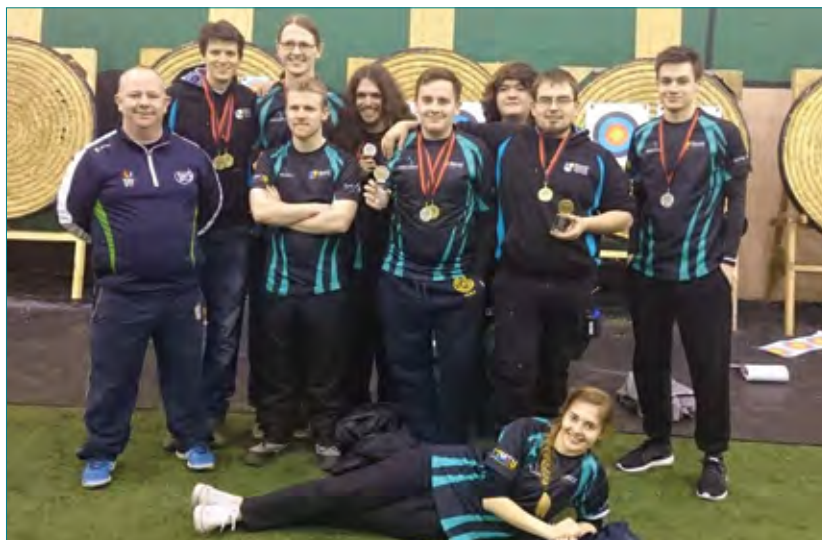
Maynooth University Archers celebrating their success