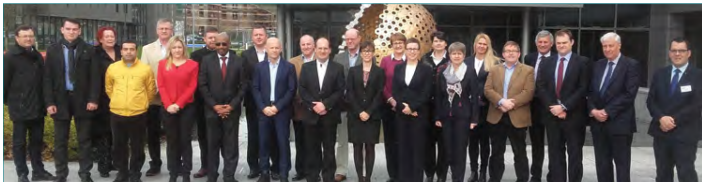
Participants of the CSDP Building Integrity (BI) course on campus

The Kennedy Institute, in association with the Defence Academy of the United Kingdom and Transparency International (UK), conducted a course for EU public servants on promoting transparency and reducing the risk of corruption 14-18 March