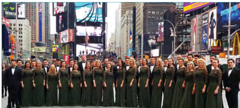
Maynooth University Chamber Choir on Times Square, New York