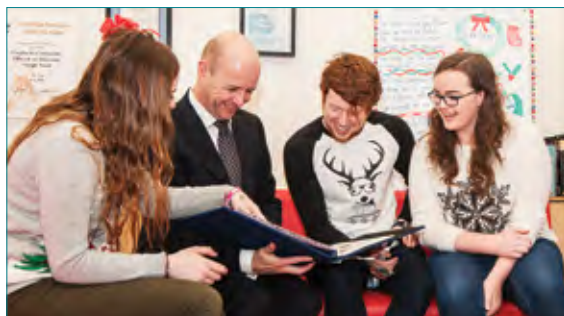
An tUachtarán Pilib Ó Nualláin le mic léinn na hOllscoile