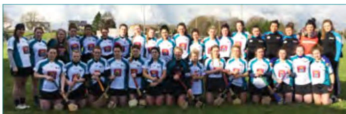
Purcell Cup Championship Runners-Up 2016