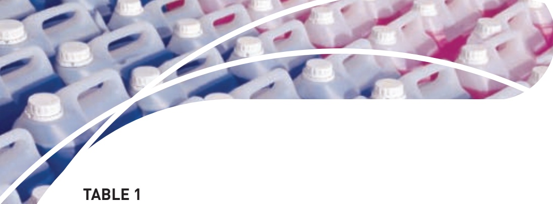
TABLE 1 Health Hazard Categories