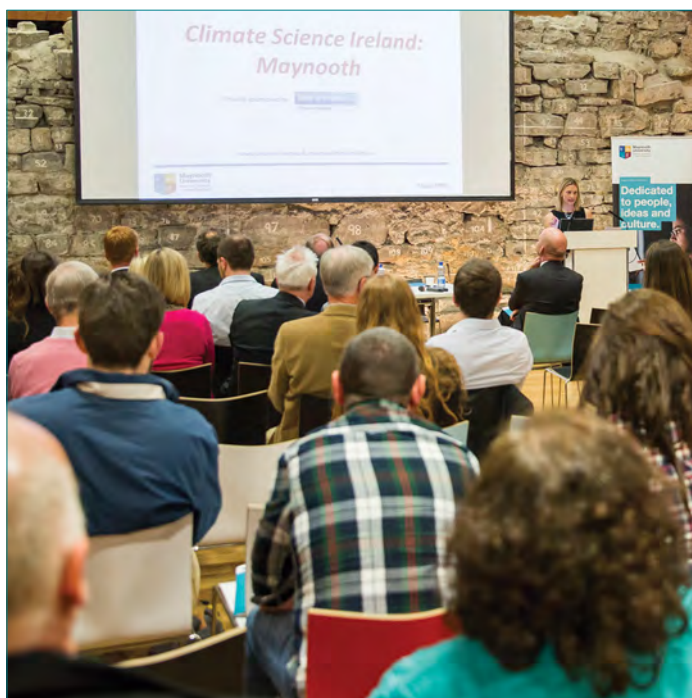
Alumni gathered to hear Maynooth scholars put a forensic spotlight on climate change