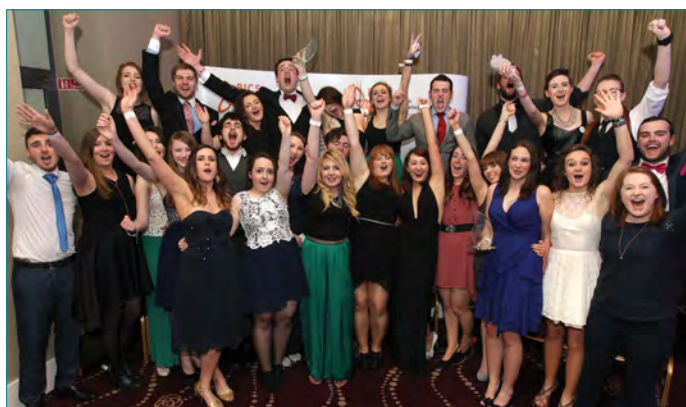
Students celebrating Maynooth University success at the BICS awards

Seven Maynooth Societies went on to represent Maynooth University at the 20th Annual Board of Irish College Societies (BICS) Awards held in Athlone.