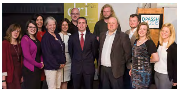
Maynooth University staff with Damien English TD, Minister for Skills, Research and Innovation