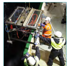
Researchers deploying underwater camera

It also offered three students from Ireland, Canada and the USA the opportunity to learn how to collect data under the guidance of marine geologists like Benjamin and Kieran who both work on mapping the Quaternary stratigraphy of specific regions of the Irish offshore.