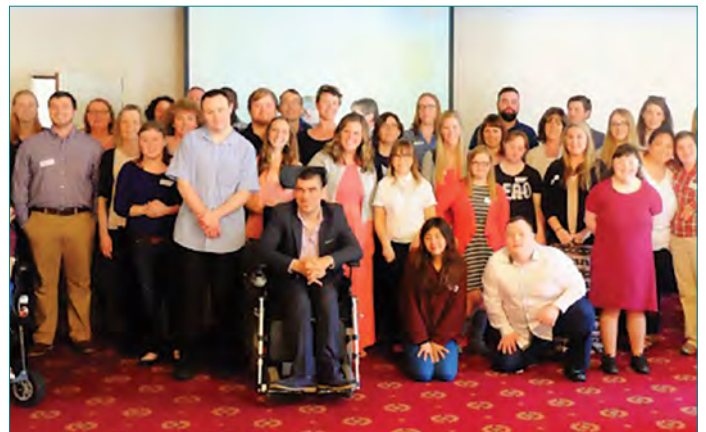
Attendees at the colloquium

It is hoped that, in future, the programme provision model in higher educational institutions will disappear and going to college will become a natural part of the life cycle for all who wish to attend. For more information contact ili@nuim.ie