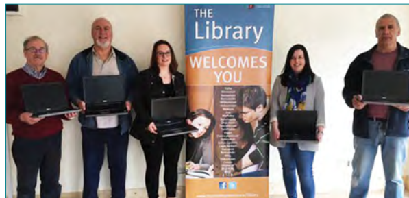
Library staff and members of the Men's Shed Project

In April, the library donated six retired laptops to the Men's Shed in Kilcock, in keeping with our commitment to engage with the local community.