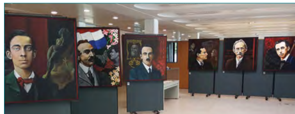
The Exhibition in the Library Foyer