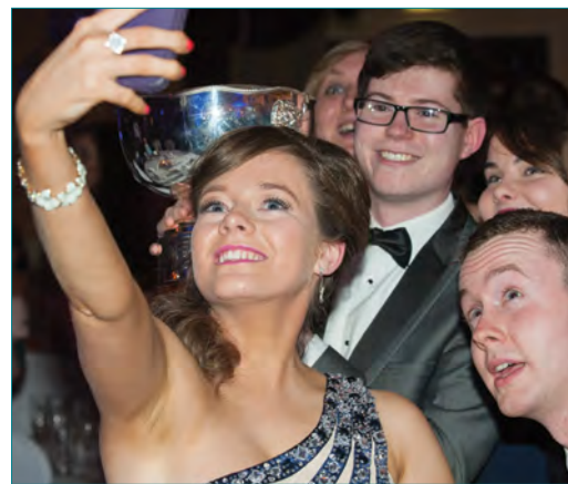
Capturing a 'selfie' at the Clubs and Socs Awards night

Maynooth University celebrated its 22nd Clubs & Societies Awards ceremony on Tuesday, 5 April