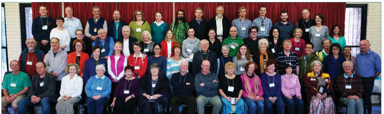
Lucht freastail Scoil Gheimhridh Sydney. Thug cuid mhór acu faoin scrúdú TEG

Tá an scrúdú bonnleibhéil don Teastas Eorpach Gaeilge (TEG) déanta ag 33 duine i Sydney na hAstráile - an chéad uair riamh gur tionóladh na scrúduithe sin an taobh sin den domhan