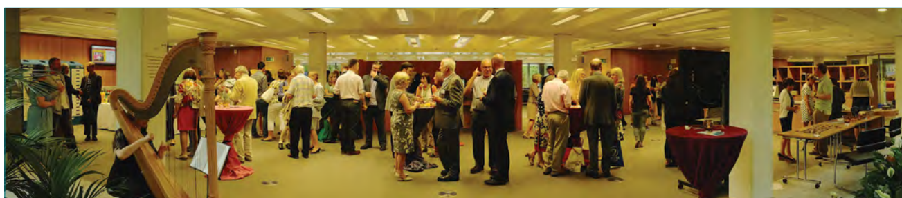
Alumni at the Summer Soirée in the Library