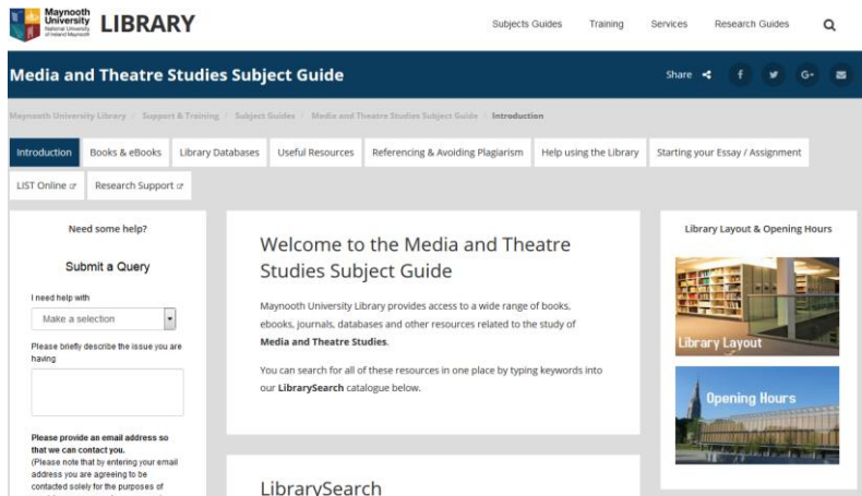
Fig 1. Media Studies subject guide online