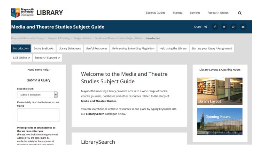
Fig 1. Media Studies subject guide online