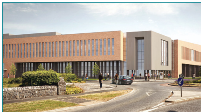
West View of the new Academic Building

Additional plans are in place to prioritise pedestrian and cyclist movement with the design of new 'public realm' initiatives to strengthen the links between the south and north ends of the campus.