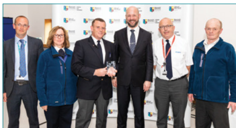
MU Security - Day Team