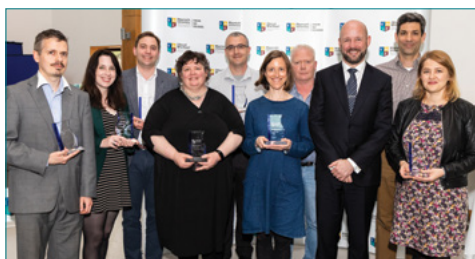
Critical Skills Team - Dean of Teaching and Learning