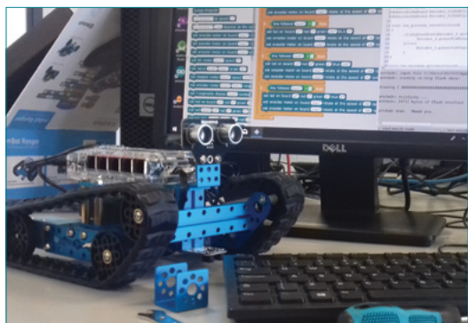
A sample of the robots built by students at the summer camp, which are programmed at the PC and then put onto a track. The aim is that each robot is programmed to autonomously complete the circuit in as quick a time as possible

Maynooth University Departments of Computer Science and Electronic Engineering hosted their summer camps again this year