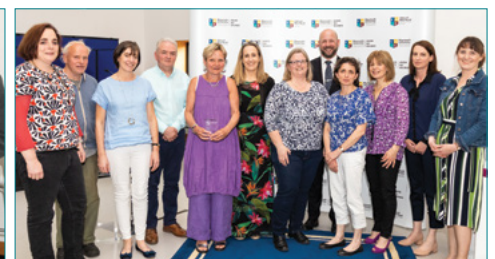
Department of Chemistry Technical Officers