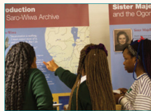
School children view the exhibition

The Maynooth University Library Ken Saro-Wiwa travelling exhibition is on display in four libraries in Wexford during June and July. It formed part of "Africa Day" activities on 25 May in Gorey Public Library. The exhibition, based on the death-row correspondence of Nigerian writer and activist Ken Saro-Wiwa was donated to Maynooth University in 2011.