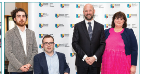
Launchpad – Maynooth Access Programme