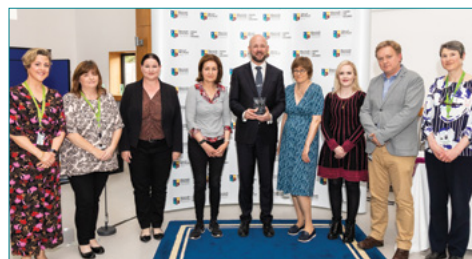
Library's Evidence Based Acquisitions (EBA)