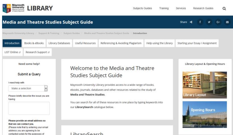
Fig 1. Media Studies subject guide online