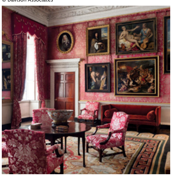
The Crimson Drawing Room, Castletown House