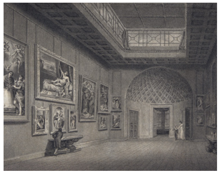
The Library, Farmleigh