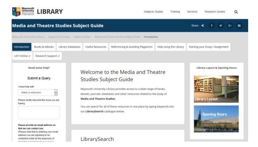
Fig 1. Media Studies subject guide online