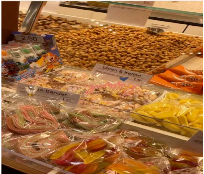
(Double tap to play video*)