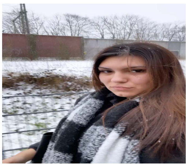
(*Double tap to play video on no.2,3 &4)